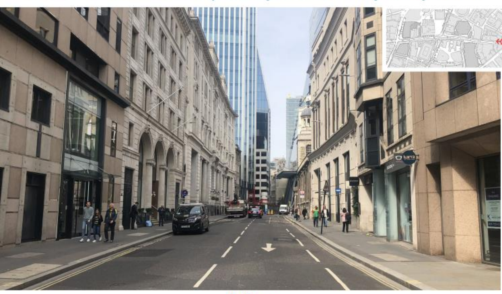
View 3 - The Eastern Gateway Looking West From Aldgate High Street