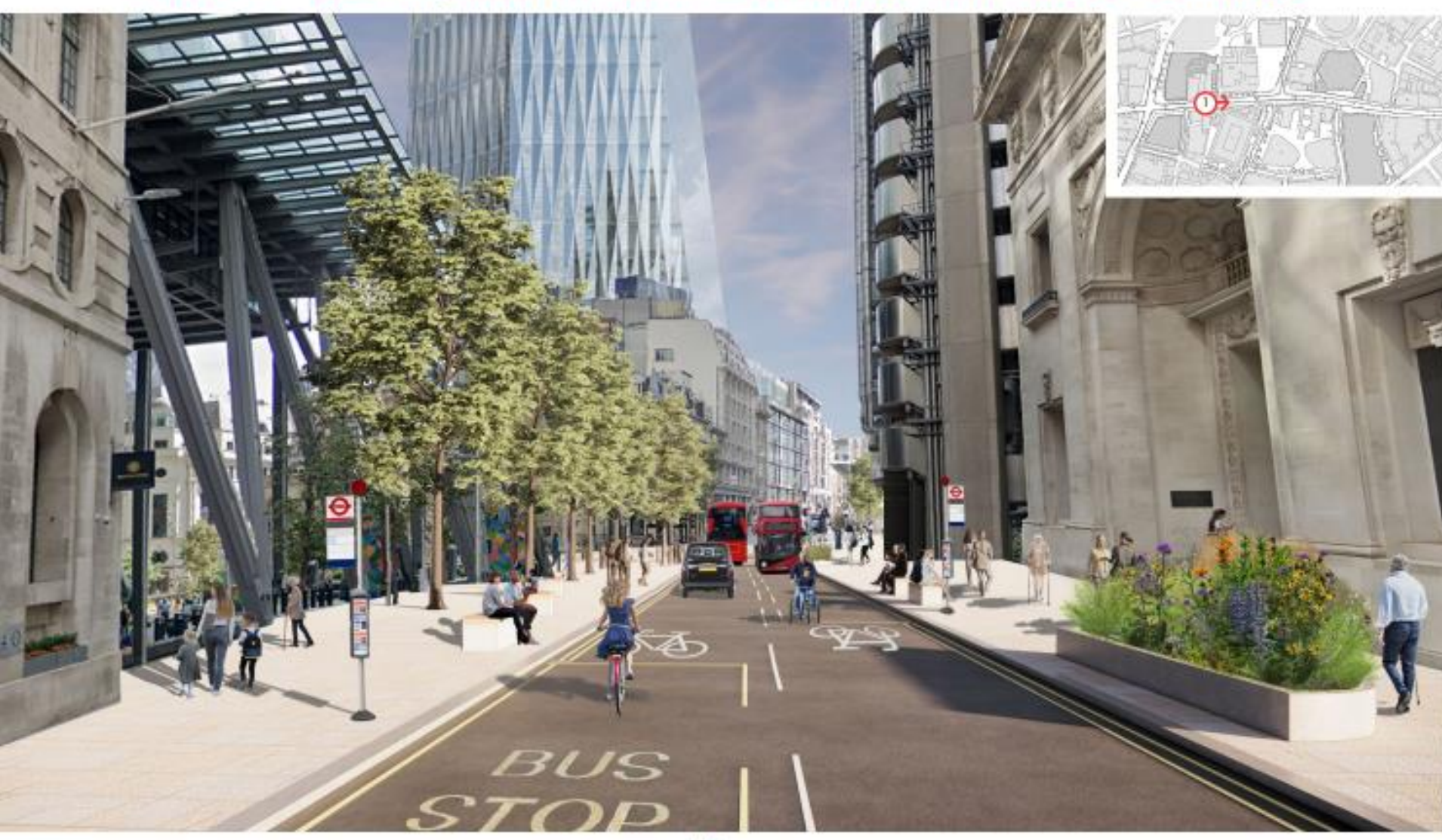
View 1 - Looking East towards Leadenhall and Lloyds buildings