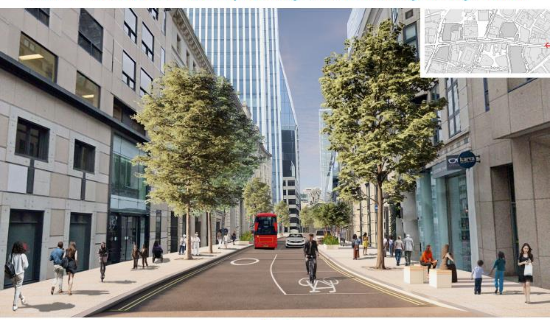
View 3 - The Eastern Gateway Looking West From Aldgate High Street