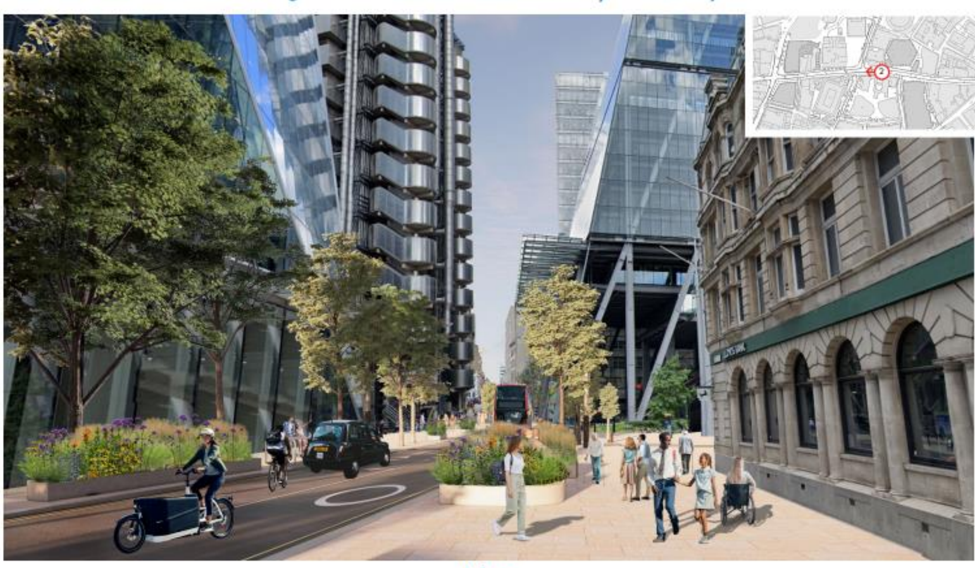
View 2 - Looking West at the Leadenhall / St Mary Axe Junction